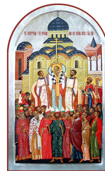
The Universal Exaltation of the Precious and Life-Giving Cross