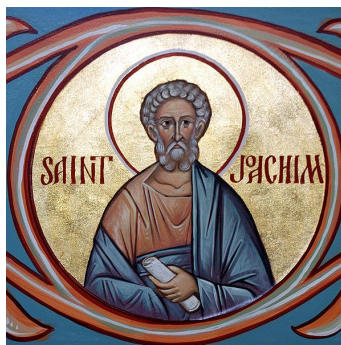
Holy and Righteous Ancestors of God, Joachim and Anna