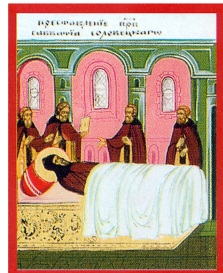
Venerable Sabbatius, Wonderworker of Solovki