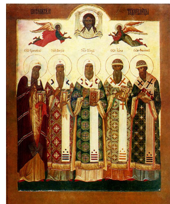
Synaxis of the Hierarchs of Moscow