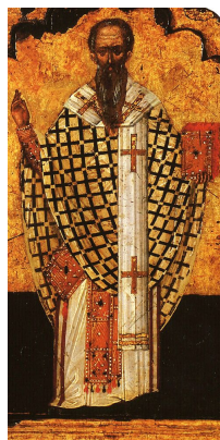
Hieromartyr Dionysius the Areopagite, Bishop of Athens