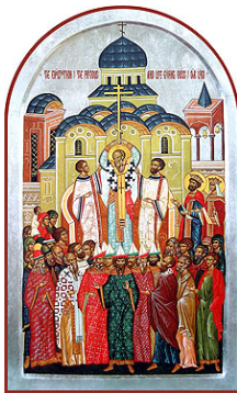
The Universal Exaltation of the Precious and Life-giving Cross

Monday, September 27 — Sunday, October 3, 2021