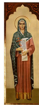
Great-martyr Euphemia the All-praised, of Chalcedon